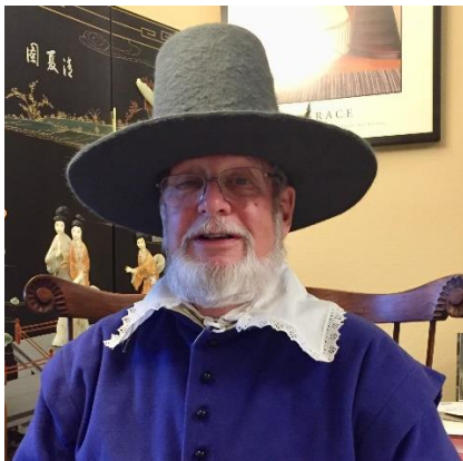
Falling band worn over doublet

Men's shirts in the 17 th century were large and long serving as underwear. Collarless shirts were worn if a separate falling band was used. Collared shirts had collars of between 2 and four inches, both plain and with lace. Falling Bands were a large, flat collar, usually trimmed with lace, worn by men in the 17th century. The falling band was worn on the outside of the doublet and was a separate garment.