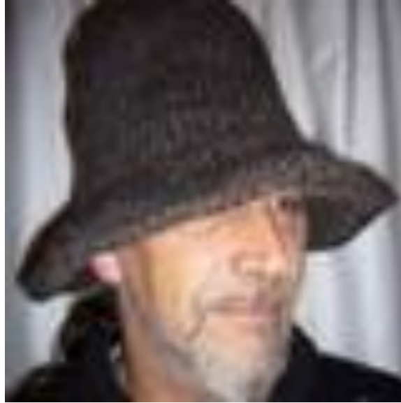
Brimmed Monmouth Cap