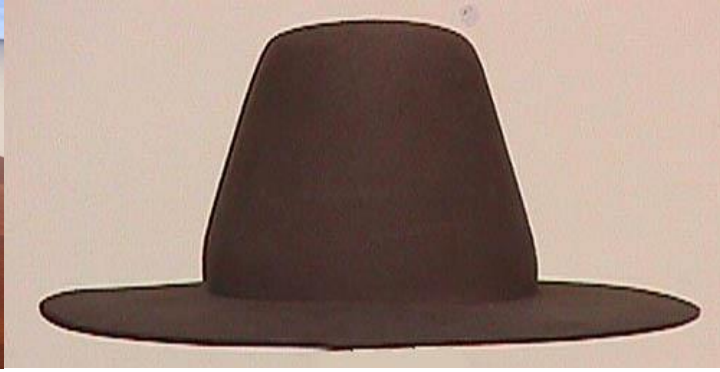
Pilgrim Hat from Dirty Billy Hats

Most brimmed hats come in three basic colors, black, brown and grey. The preferred colors are grey and brown. The modern version of the brimmed is known as the open crown hat. The open crown hat is available from numerous western wear vendors and manufacturers including Stetson, Resistol, and Twister which vary in price from over $349 to $65. Dirty Billy Hats in Gettysburg is a custom hat maker making reproduction hats of various era. They can custom make a tall 7 1/2 -inch crown Pilgrim hat. Top Hats.com offers two versions of a pilgrim appropriate brimmed hat, the Charles #261 and the Plymouth #264 are both high crown hats. There are a variety of vendors for open crown felt hat including: