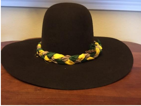
Open Crown Hat