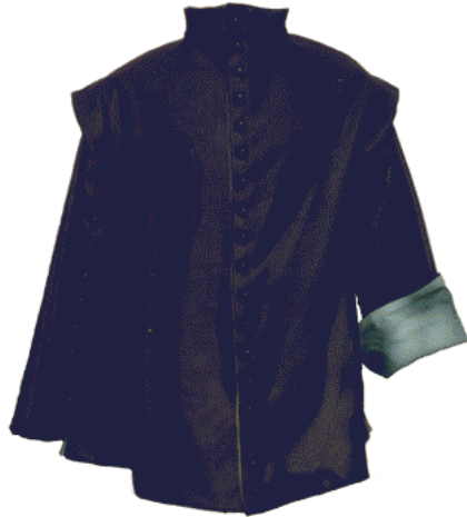
Buttoned to show both styles of wear