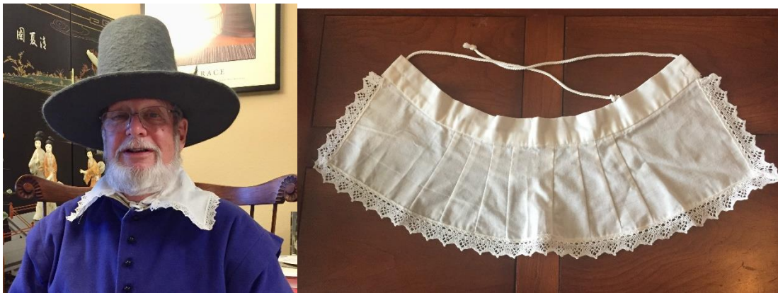
Falling band worn over doublet

Men's shirts in the 17 th century were large and long serving as underwear. Collarless shirts were worn if a separate falling band was used. Collared shirts had collars of between 2 and four inches, both plain and with lace. Falling Bands were a large, flat collar, usually trimmed with lace, worn by men in the 17 th century. The falling band was worn on the outside of the doublet and was a separate garment.